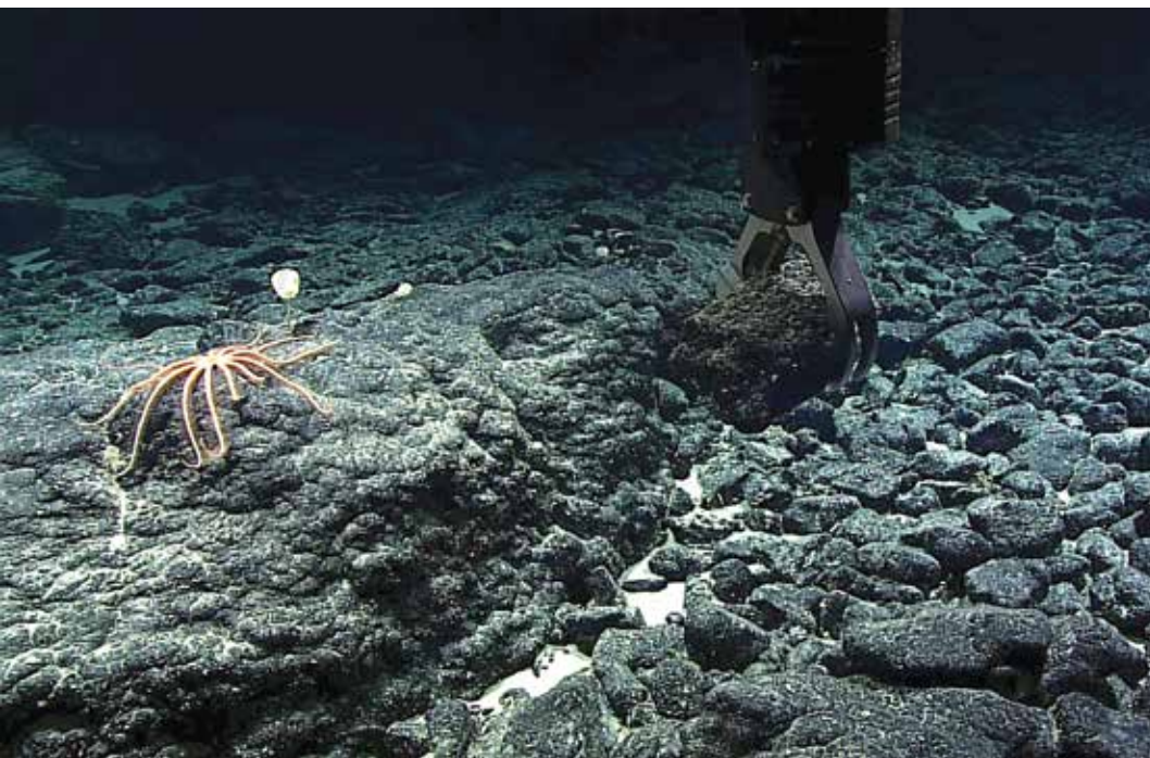
Deep Discoverer grabs a manganese-encrusted rock sample near a brisingid sea star at about 2,400 meters depth at a site near the Cook Islands. Image courtesy of the NOAA Office of Ocean Exploration and Research, Mountains in the Deep: Exploring the Central Pacific Basin . PAGE 1: ROV Deep Discoverer explores the Clipperton Fracture Zone. This was the deepest dive on the expedition. Image courtesy of the NOAA Office of Ocean Exploration and Research, Mountains in the Deep: Exploring the Central Pacific Basin .

All of these expeditions are helping to establish foundational information and will catalyze further exploration, research, and management activities.