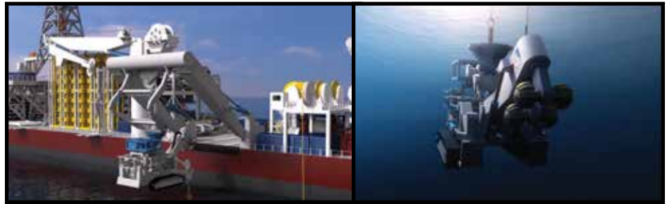
A visualization depicting the deployment of Nautilus' Auxiliary Cutter using the Launch and Recovery System (LARS). AT LEFT: The Nautilus Seafloor Production Tools (SPTs) from left to right, the Collecting Machine (CM), the Bulk Cutter (BC) and the Auxiliary Cutter (AC). All three were designed and built at Soil Machine Dynamic's facility in Newcastle Upon Tyne, UK.

FMSL has awarded several other contracts for the PSV.