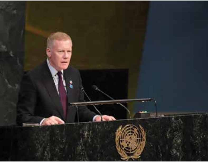
PAGE 1: