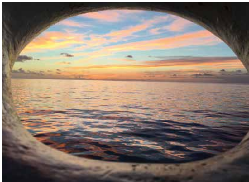
Sunset over the Central Pacific Basin. Ocean resources beyond national boundaries are considered the Common Heritage of Mankind.

This past 19–21 April, contractors and other ISA stakeholders gathered in Singapore at the Grand Copthorne Waterfront Hotel for the 3rd Deep Seabed Mining Payment Regime Workshop. Prior meetings had been held in 2016 in both San Diego (USA) and London, all with a focus on exploring key elements of an ISA payment mechanism and financial regulations for seabed mineral exploitation in the Area, and particularly for polymetallic nodules. The Singapore workshop provided an opportunity for participants to continue efforts to develop a working financial model (for both cost and revenue) to share with the ISA’s Legal and Technical Committee (LTC). While additional work still needs to be done, the group was able to explore additional issues important to consider in the development of any working payment regime—for instance, accounting for ISA’s administrative costs. The meetings were facilitated by RESOLVE, an independent non-profit organization specializing